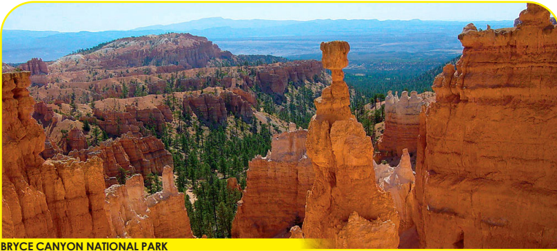
BRYCE CANYON NATIONAL PARK

1 FLIGHT TO PHOENIX • SEDONA: Our flight today will take us to Arizona's capital, Phoenix. Our motorcoach meets us here and transports us to our first overnight, Sedona. As we approach this beautiful town, known worldwide for the beauty of the red rocks, we can easily see why it's one of Hollywood's favorite movie locations.