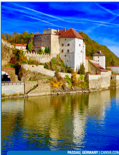
PASSAU, GERMANY | CANVA.COM